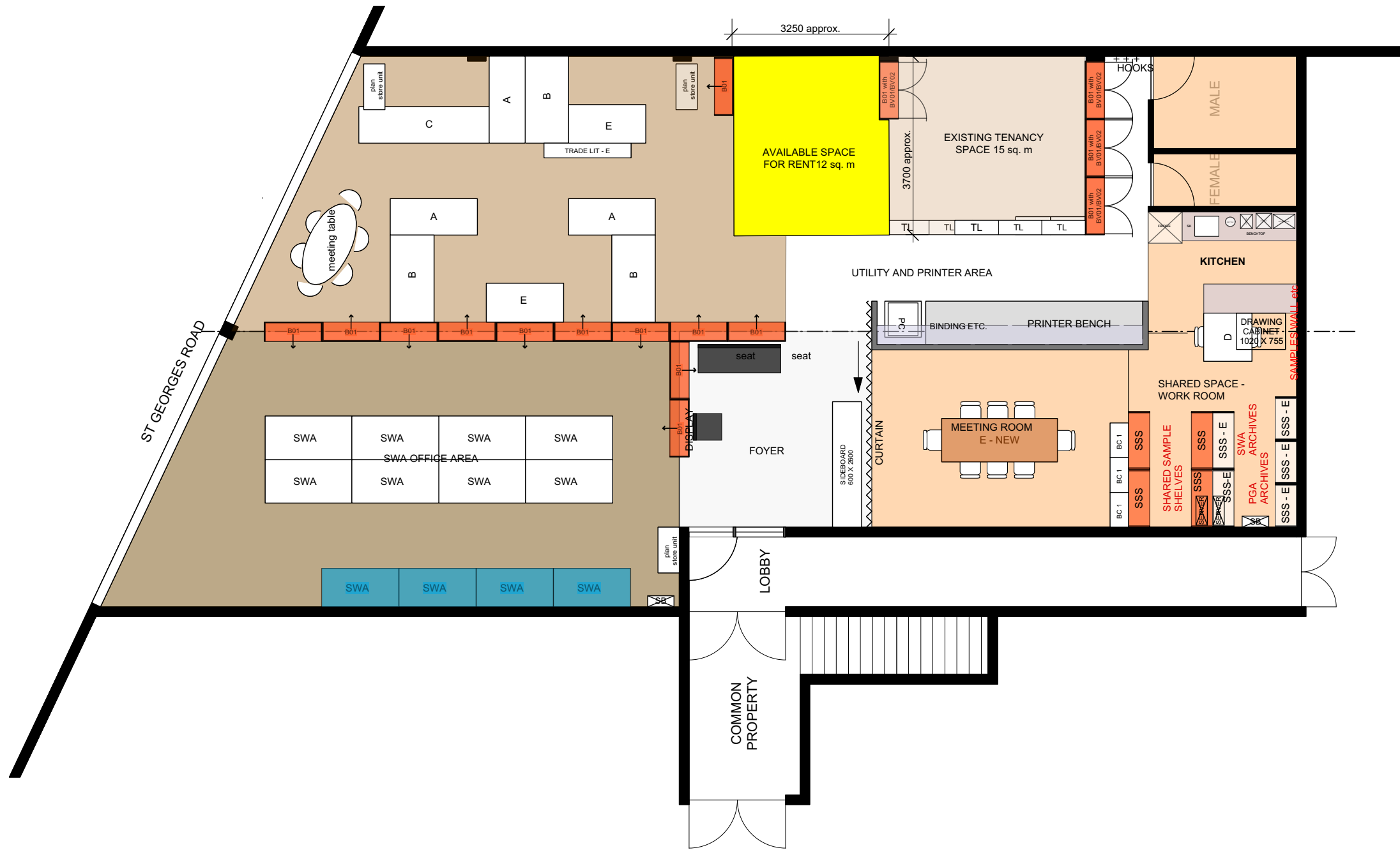
1 OFFICE FLOOR PLAN Scale 1:50

This drawing to read in conjunction with the other contract documents including the project specification and any instructions issued during the course of the contract. Contractors must verify all dimensions on site before commencing any work. Do not scale any dimensions from drawings. Advise Architect of all discrepancies in documents.